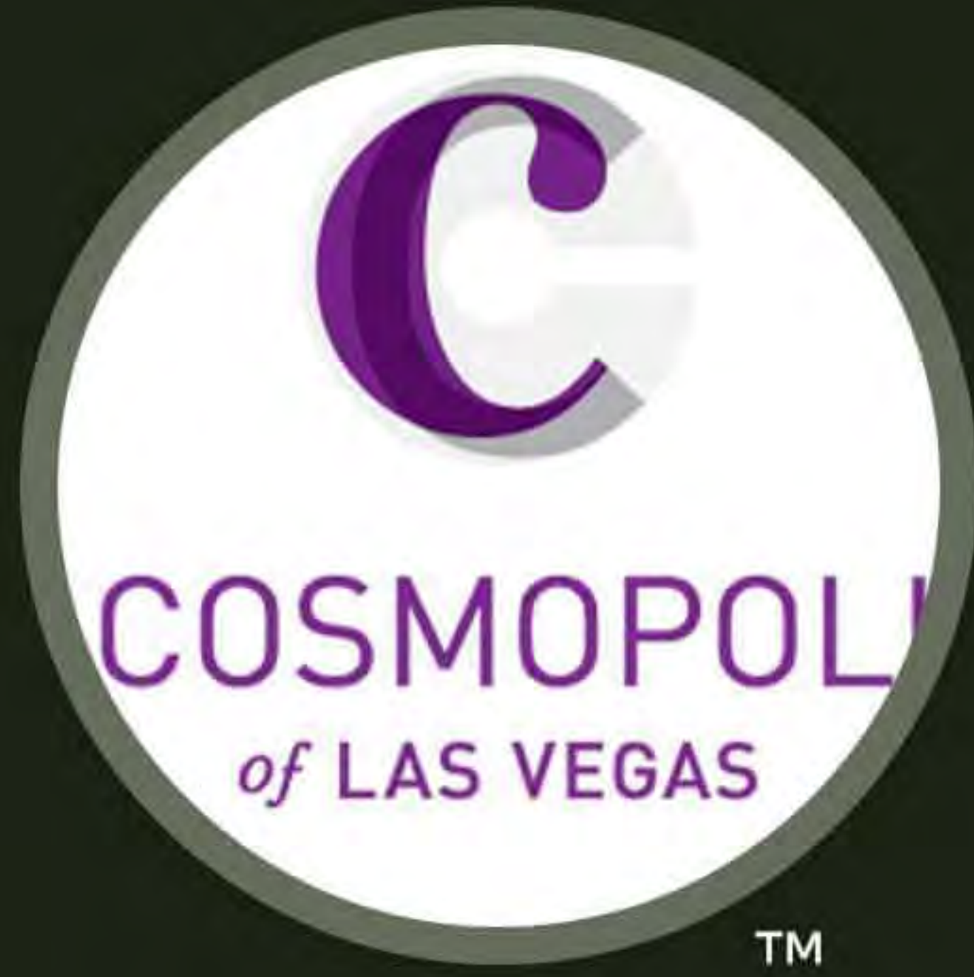
Cosmopolitan of Las Vegas