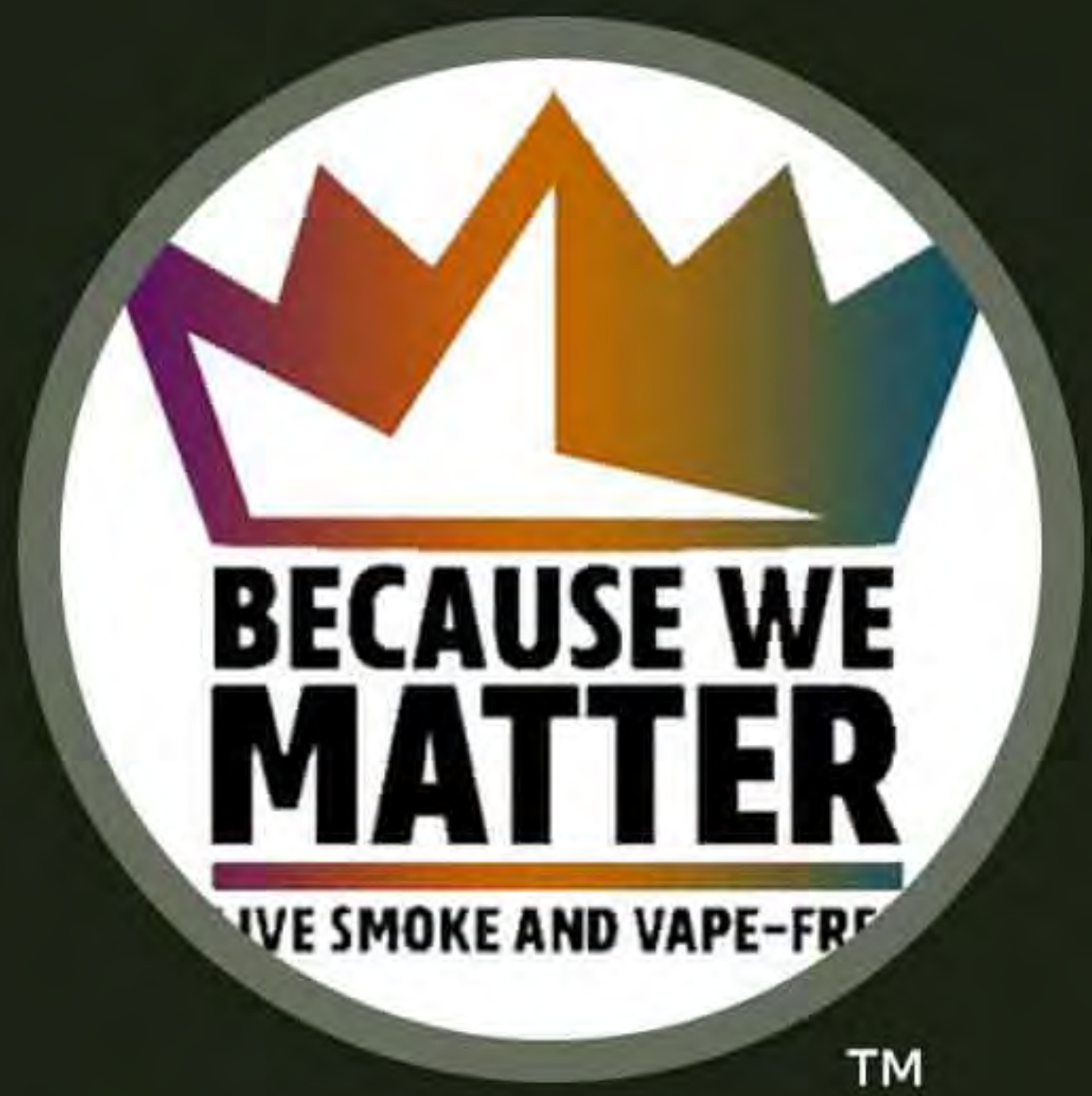
Southern Nevada Health District