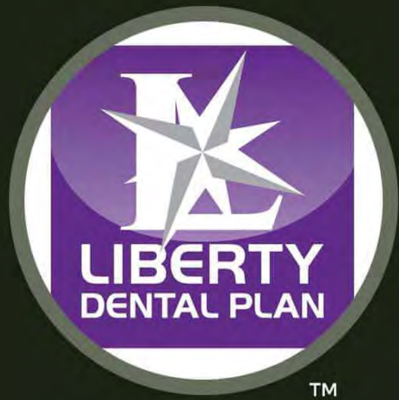
Liberty Dental Plan